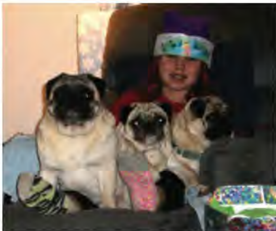
Litter mates with our granddaughter.